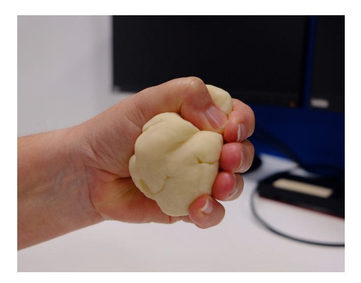
1. Squeeze the dough with all your fingers and your thumb.

Hold each position for a few seconds and repeat 5 to 10 times depending on your ability.